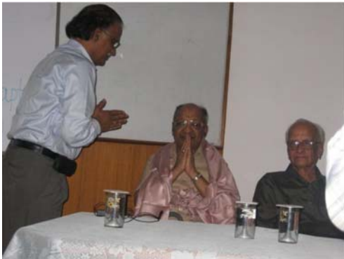
Our Seniors honoured during AGM