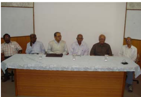
Our teachers honoured...14th September