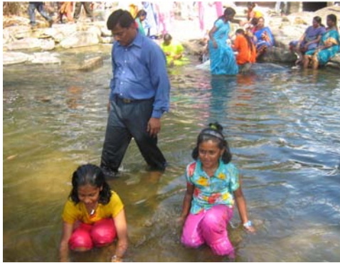
Picnic to Hognekal 10th February