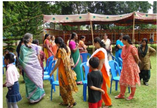
Merry go round