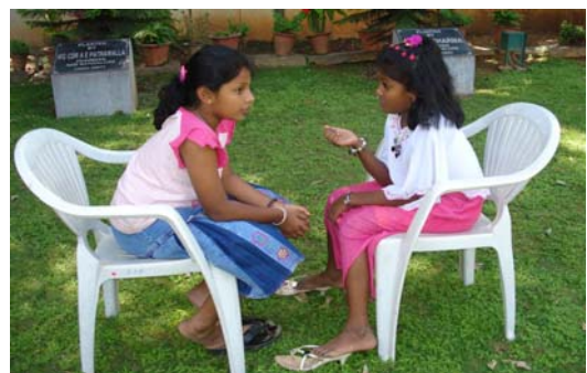
On the sidelines enjoying themselves