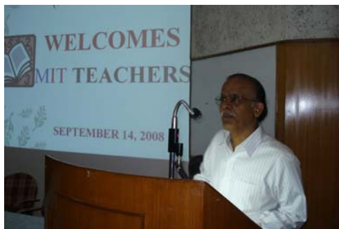
Our teachers introduced - 14th September