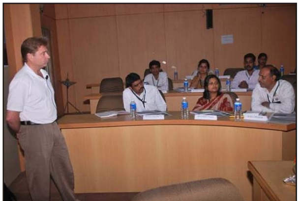
DO Training Training in Progress