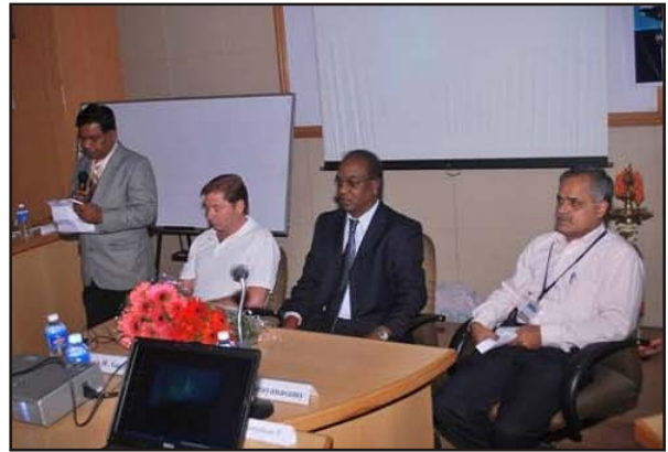
DO Training Inauguration