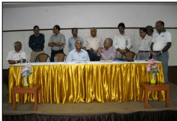
Parent Chapter AGM New Executive Committee Members