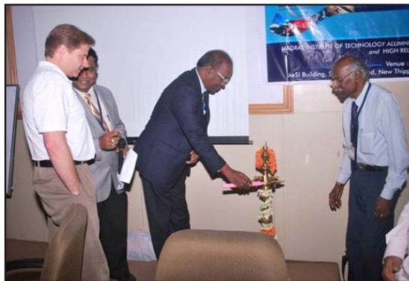
DO Training Lighting the Lamp by Chief Guest