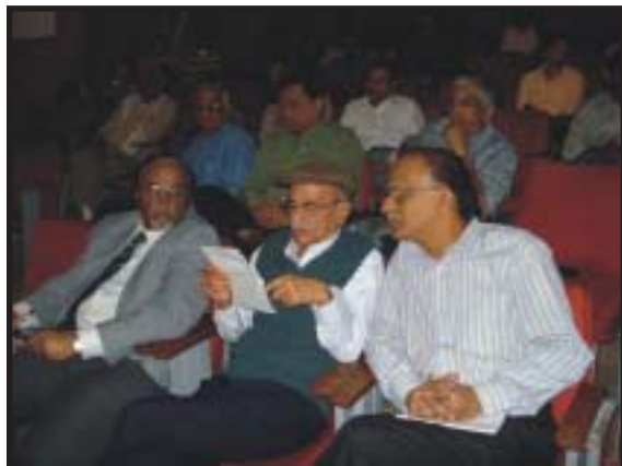
Audience of Panel Discussion Event