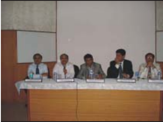
Panelist sharing their experience